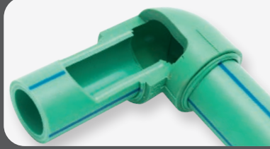
SOCKET Ø 20-125 mm

The PP-R 100 SDR 7,4 pipe is compatible with the following welding techniques: