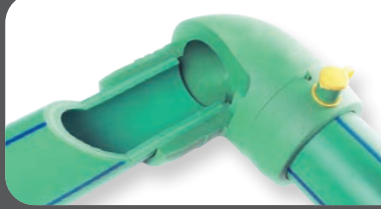
ELECTROFUSION Ø 25-315 mm