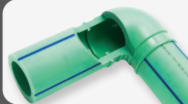
BUTT WELDING Ø 160-400 mm